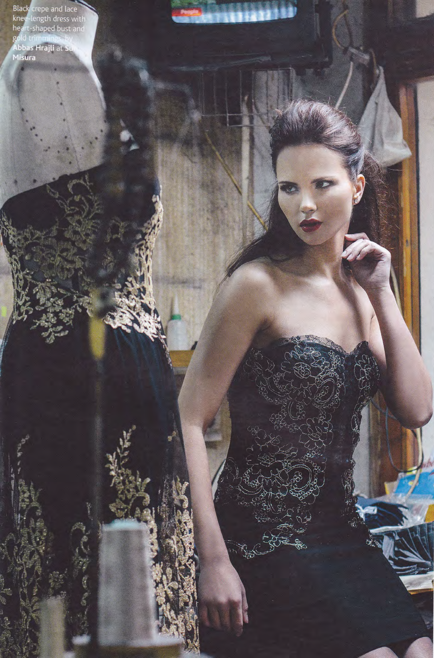
Black crepe and lace knee-length dress with heart-shaped bust and gold trimmings, by Abbas Hrajli at Sur Misura