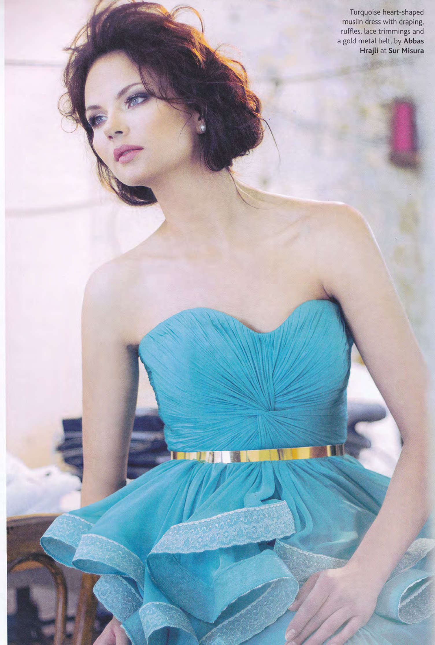
Turquoise heart-shaped muslin dress with draping, ruffles, lace trimmings and a gold metal belt, by Abbas Hrajli at Sur Misura