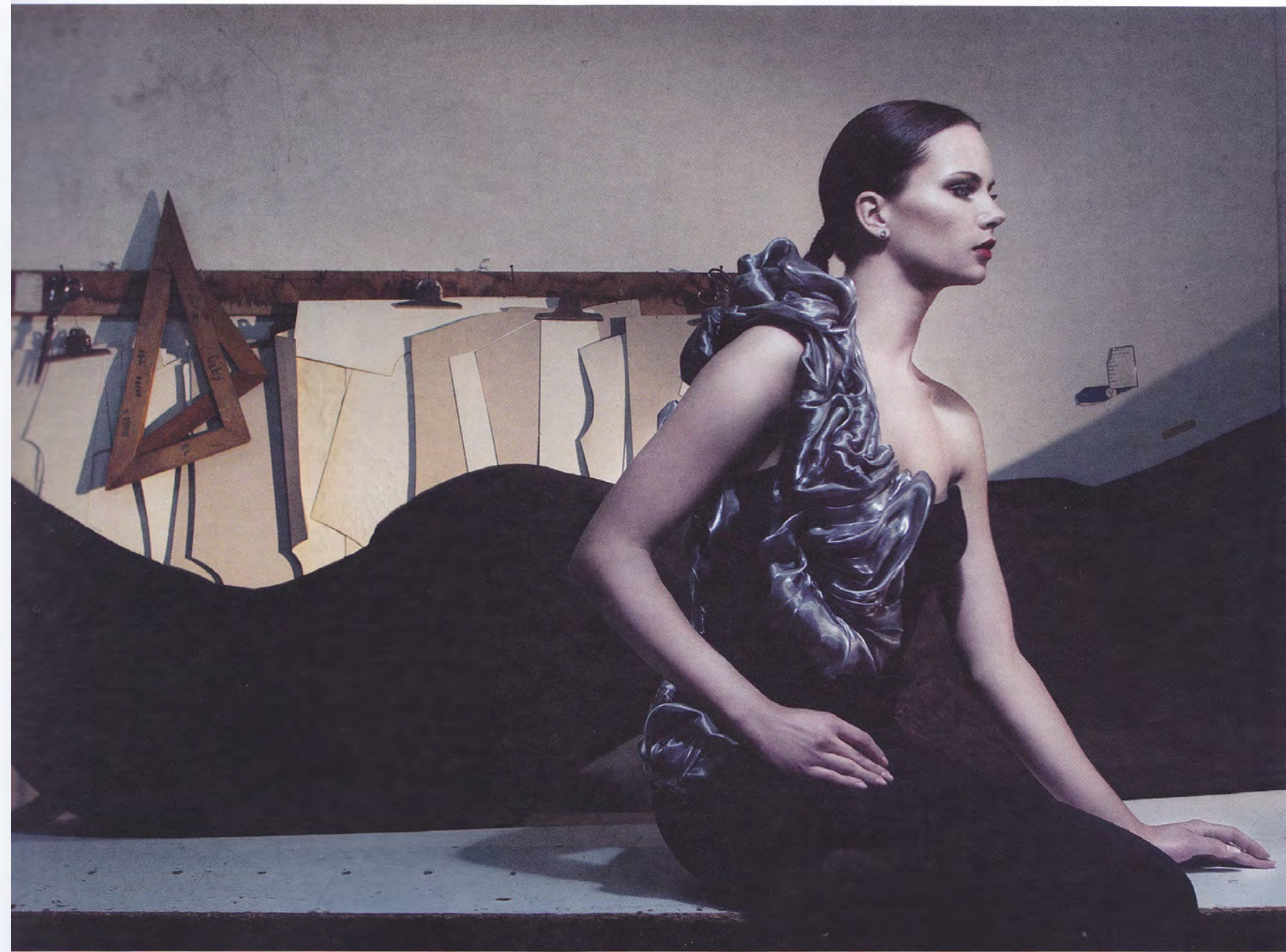
Black and silver one-shoulder crepe dress with muslin, by Abbas Hrajli at Sur Misura