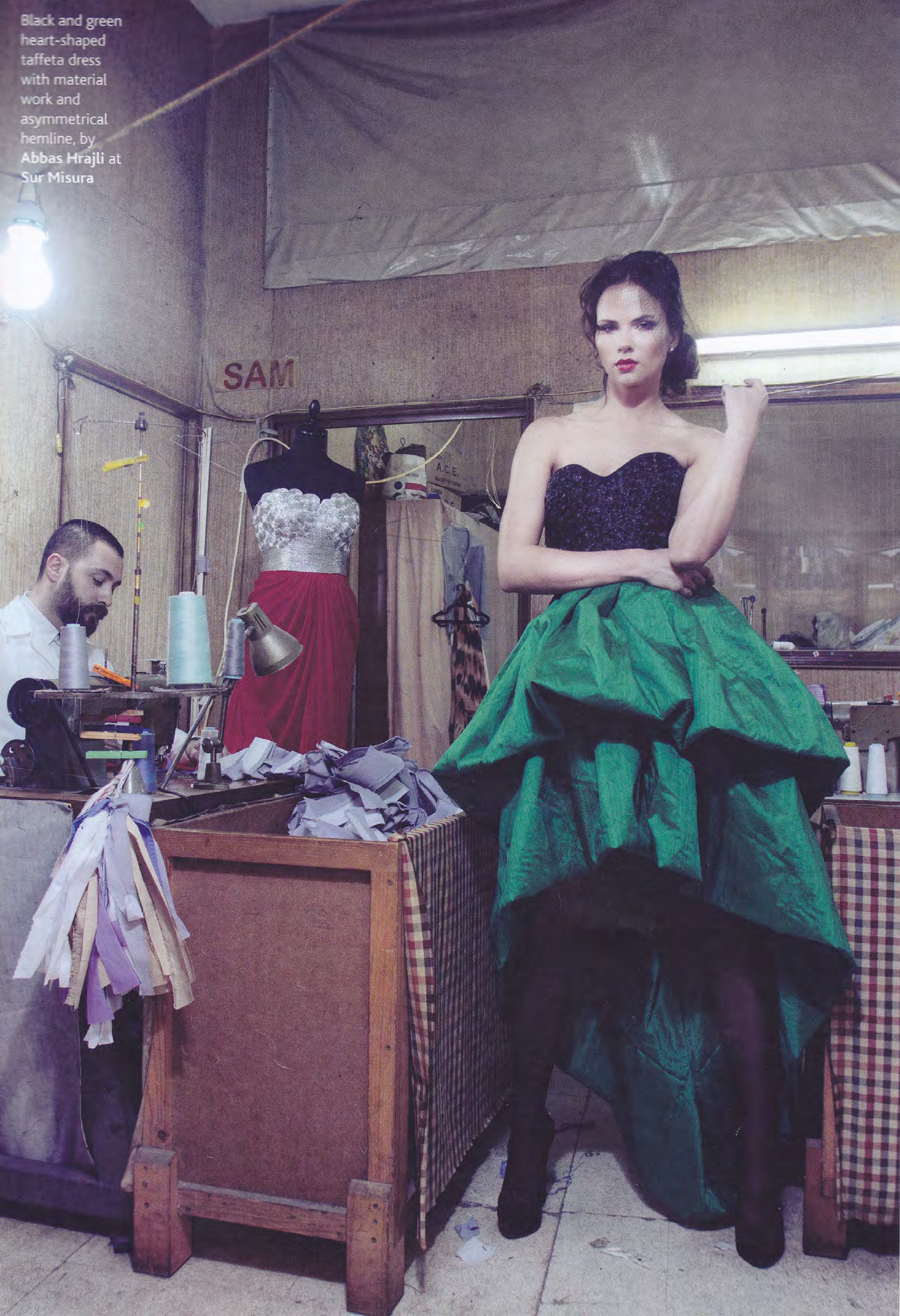
Black and green heart-shaped taffeta dress with material work and asymmetrical hemline, by Abbas Hrajli at Sur Misura